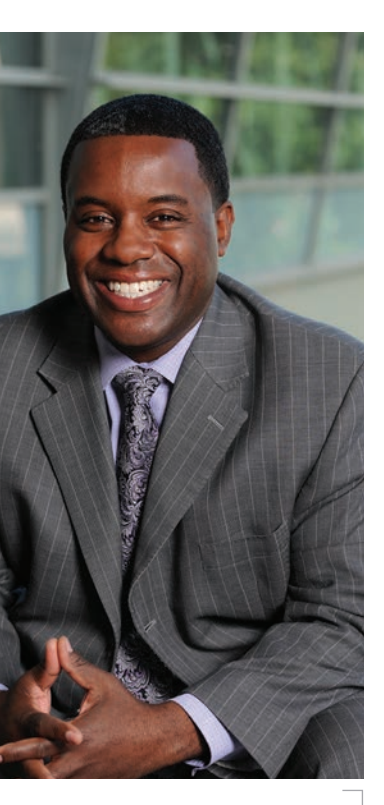
O A PARADIGM SHIFT Exploring the high-risk psyche

EUREKA MOMENTS Novel MDS therapy emerges C