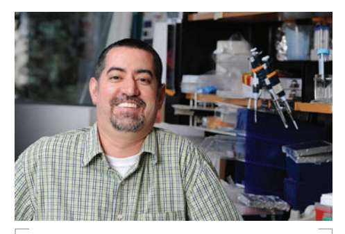
PRAGMATIC REALIST 6 Uses proteomic technology to ID new therapies